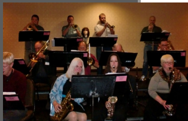
Alumni Jazz Band

If you plan to play with the UM Alumni Jazz Band, please indicate this on your registration form. Each year we have numerous alums who perform wonderful big band swing tunes to the delight of the multitudes. Knowing in advance that you are planning to participate will help in the facilitating of the performance. This way all who wish to perform will get a chance. The timing format for the UM Alumni Jazz Band was altered last year in order to accommodate another performance by a performing group of a different music medium. It ended up being very successful for the UM Alumni Association and the Holiday Inn resulting in the best revenue Friday night ever for a Homecoming weekend. The format will run again the same as it did at last year's Homecoming. Please note the earlier start time for the jazz band performance.