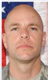
TRAVIS W. ATKINS U.S. Army Staff Sergeant 1975-2007 Bozeman